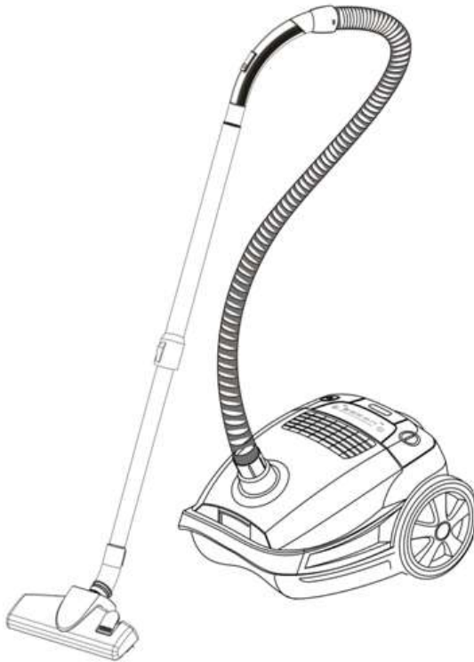
Canister Vacuum Cleaner